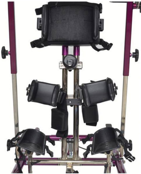
Fig. 2. Footplates to ensure biomechanical alignment at the ankle and foot, especially with 15° to 30° angles of bilateral hip abduction.

with standing for 10 minutes, twice per day, to increase muscle strength. 28,30