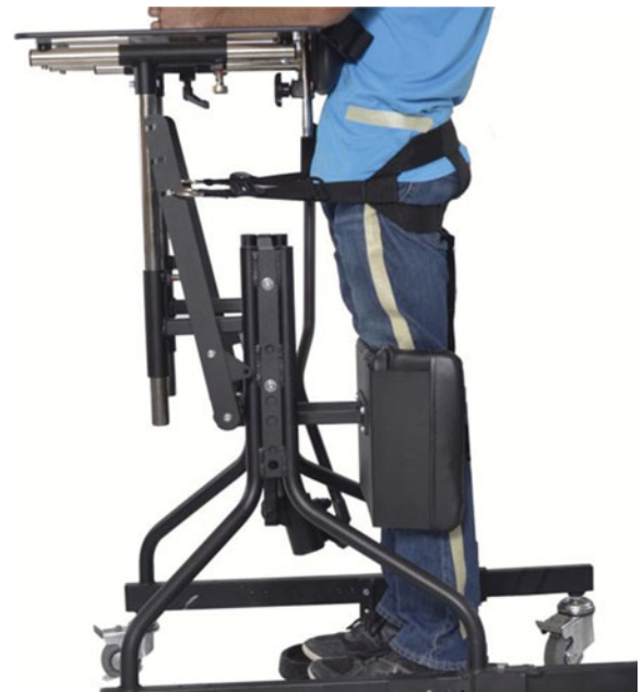
Fig. 3. Sling style stander that allows trunk to be unsupported. Some children are able to lean backward and stretch hip flexors. Tape used to illustrate angle of femur and pelvis.

Other consideration (authors' opinions). The effect on spasticity may last only for 35 minutes; therefore, follow standing with an activity that may improve with this short duration of decreased spasticity, such as dressing or walking. 33