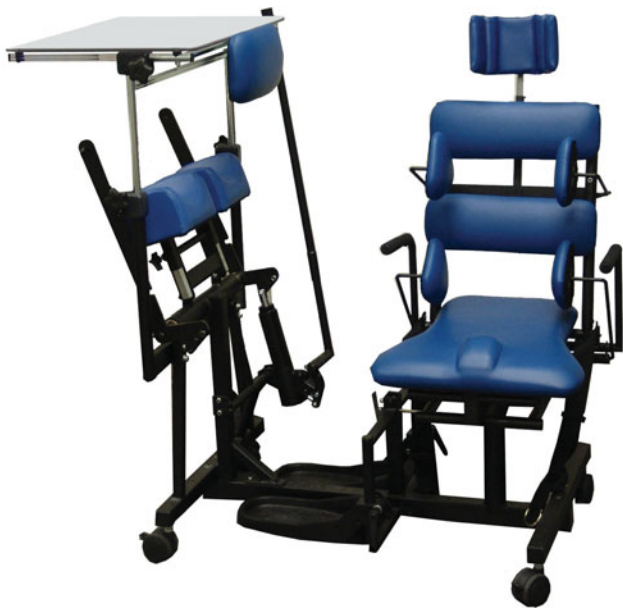
Fig. 5. Sit-to-stand or standing wheelchair stander might be ideal to decrease shear during multiple transfers.

a From the International Classification of Functioning, Disability, and Health, Child and Youth Version model ( http://apps.who.int/classifications/icfbrowser/ ).