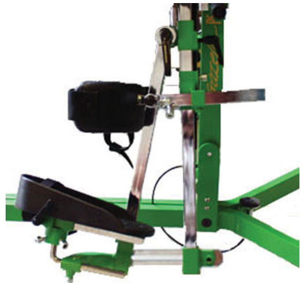
Fig. 4. Contracture bracket used to accommodate moderate to severe knee (–45°) contractures/deformities. This figure is available in color in the article on the journal website, www.pedpt.com , and the iPad.